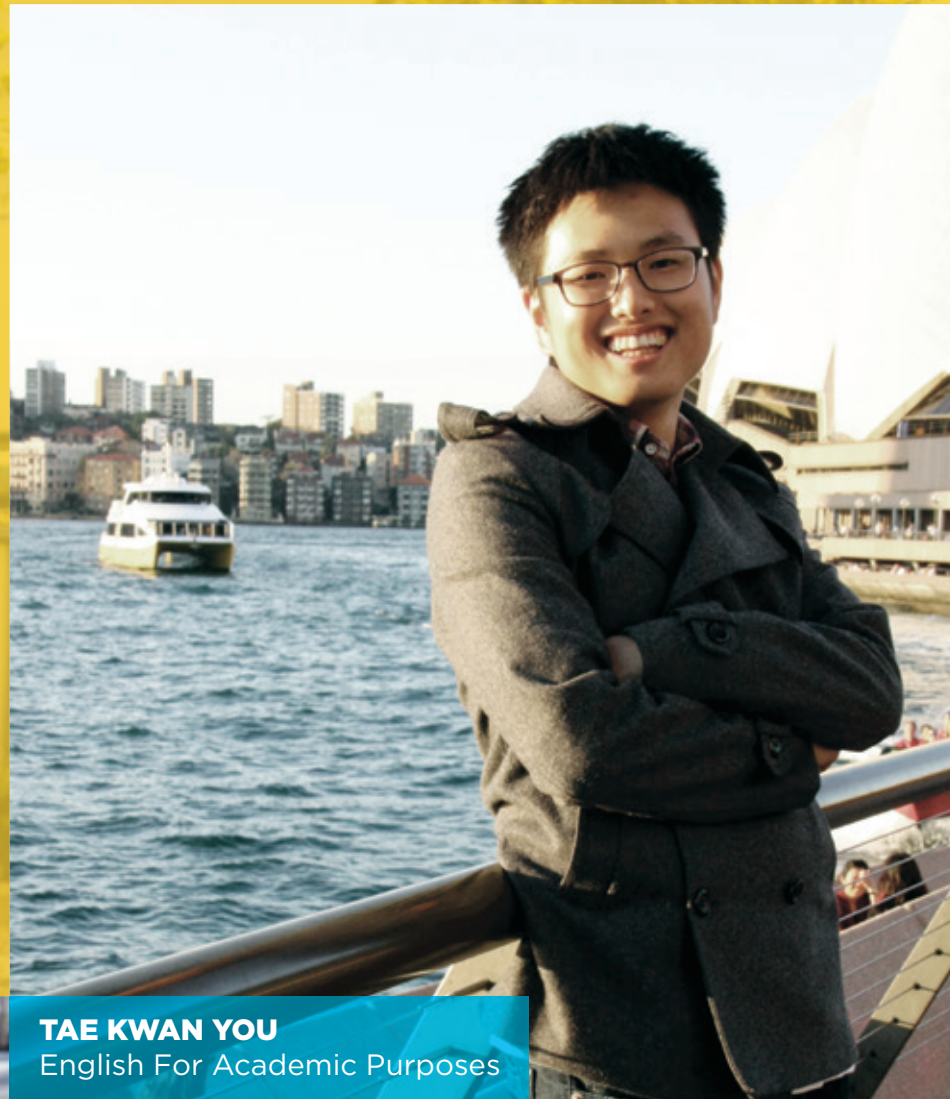
TAE KWAN YOU English For Academic Purposes

"I studied English for Academic Purposes at Kingsway because I had to have the proper level of English language knowledge to be able to study at University.